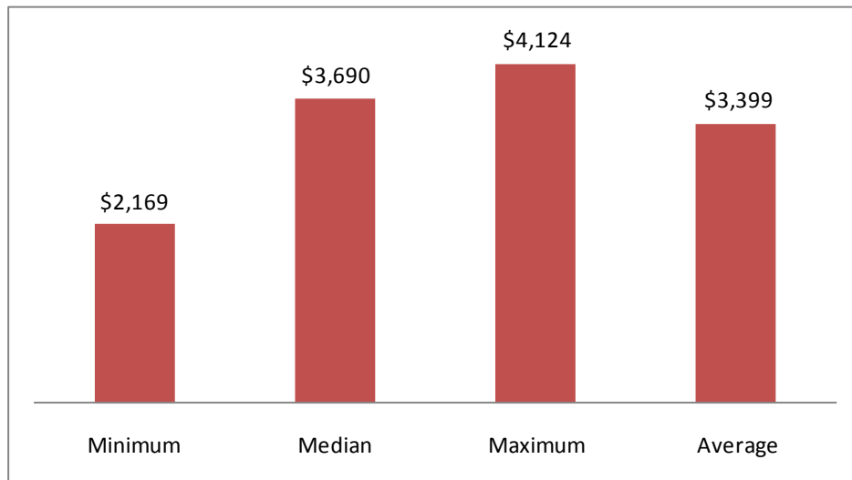
Chart 3, Comparison of annualized tuition and fees for USO two-year institutions, 2010/2011 brings together minimum, median, maximum, and mean values for in-state (technical colleges) and in-district (community colleges) tuition and fees at 23 USO institutions.